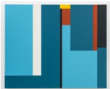
Nassos Daphnis 1-90 , 1990 Oil on canvas 36.13h x 44.13w in 91.76h x 112.08w cm ND-15-012