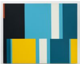
Nassos Daphnis 3-90 , 1990 Oil on canvas 36.13h x 44.13w in 91.76h x 112.08w cm ND-15-014