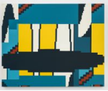
Nassos Daphnis 1-89, 1989 Oil on canvas 36.13h x 44.13w in 91.76h x 112.08w cm ND-15-008