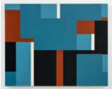
Nassos Daphnis AE 11-92 , 1992 Oil on canvas 24.13h x 30.25w in 61.28h x 76.84w cm ND-15-022