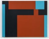
Nassos Daphnis 10-90 , 1990 Oil on canvas 24.25h x 30.13w in 61.60h x 76.52w cm ND-15-016