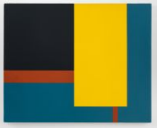
Nassos Daphnis 7-90, 1990 Oil on canvas 24.25h x 30.13w in 61.60h x 76.52w cm ND-15-015